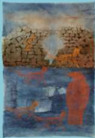
"Odin's ravens at the building site"