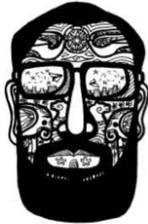
Chadi Adib Salama "100 faces around the world"