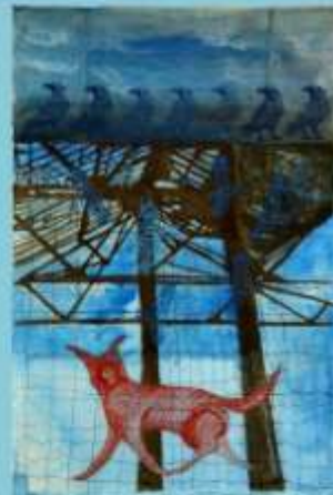
"The Fenrir wolf of today"