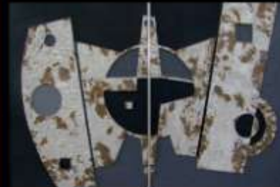
Creation 123. Amaru Chiza. Ecuador. USA