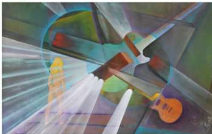
Fausto Morin Cantuche "Ibiza: luces y pasión"