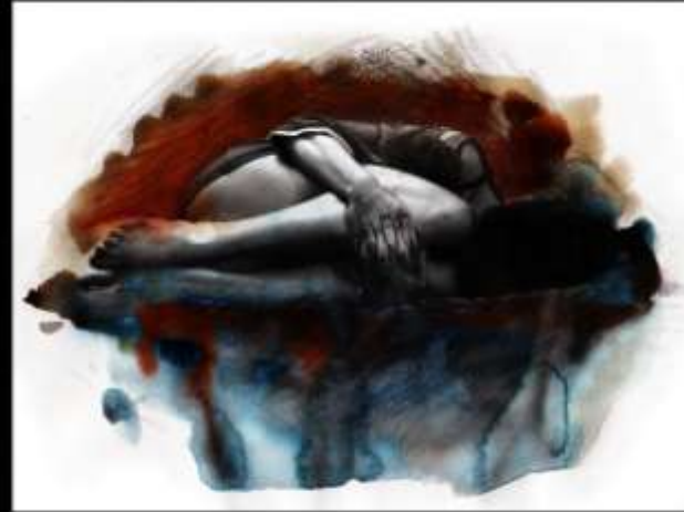
"The silent whisper"

THE TRAVELLING GALLERY - NEXT STOP Lewis Gallery of the Public Library of Portland, Maine. USA. From the 3th to he 31th of July 2015 17 countries, 50 art Works, different media.