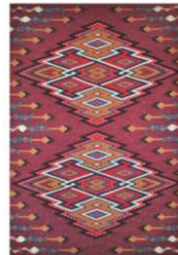
"Ofrenda - textil"