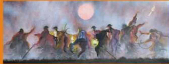
Juan Caiza "El juego"

THE TRAVELLING GALLERY 2016 Rådhusgalleriet Oslo - NORWAY