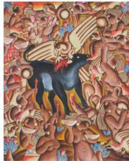
Victor Salvo "Yawar Fiesta-Fest of Blood"