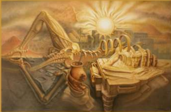
Froilán Cosme Huanca "Metamorfosis"