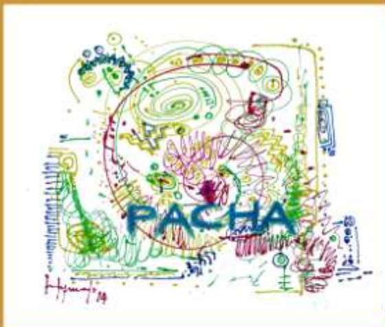
Inty Muenala "Pacha"