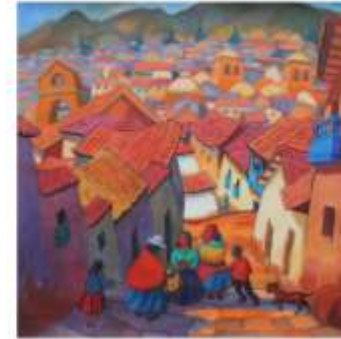
"San Blas Cusco"