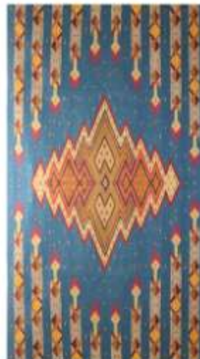
"Biluz stee xisluu - textil"